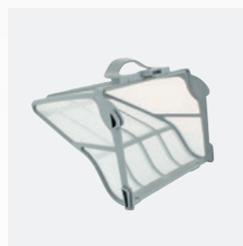
Filter canister Very thin, large-capacity rigid filter (5 litres)