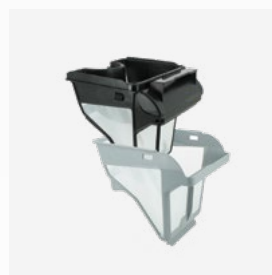
Filter canister Dual stage filter: 150/60 µ