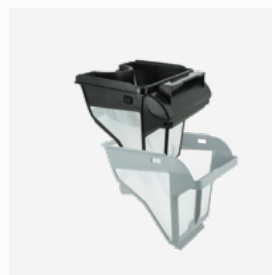
Filter canister Dual stage filter: 150/60 µ